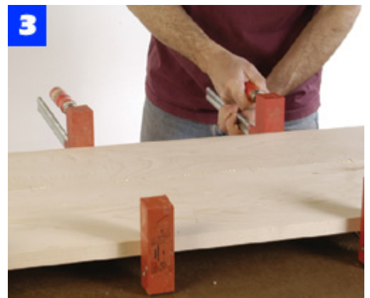
Use clamps to pull the panel joints tight. A clamp every 10 to 12 in. should provide adequate pressure.