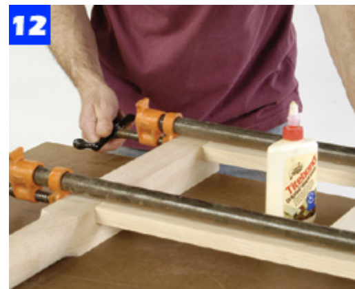
After assembling the face-frame parts, join the frame to the front legs. Keep the clamps in place until the glue has set.