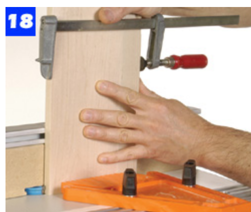
Hold the stock on end to rout the drawer joint on the drawer sides. A backer board clamped in place prevents tearout.