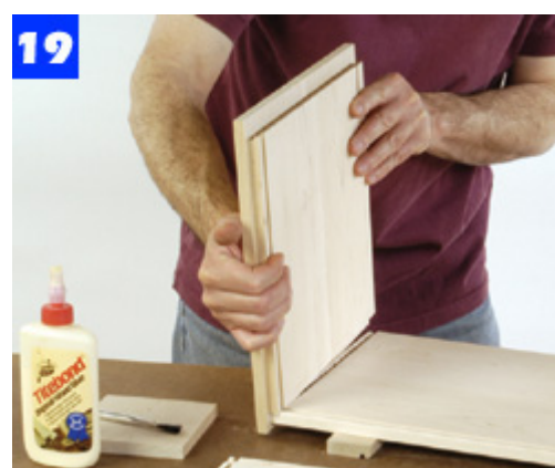
After routing the drawer-face rabbets and the grooves for the bottoms, apply glue and assemble the drawers.