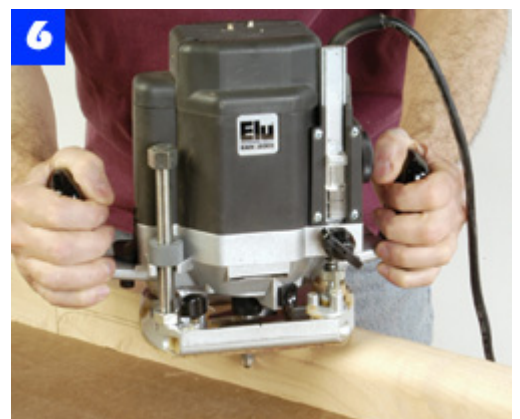
For the look of lathe-turned legs, use a router with a 1-in.-rad. rounding-over bit on each leg corner.