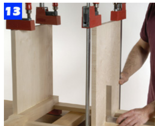
Join the partitions and sides to the face-frame assembly with plate joints. Check the assembly with a square.