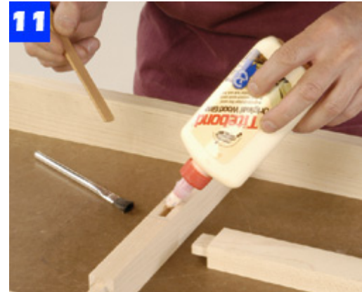
Coat all face-frame joint surfaces with glue. A small brush and wooden applicator make the job go smoothly.

Cut the drawer runners to size. Bore and countersink pilot holes in each piece and install them to the side and partition panels (Photo 15).