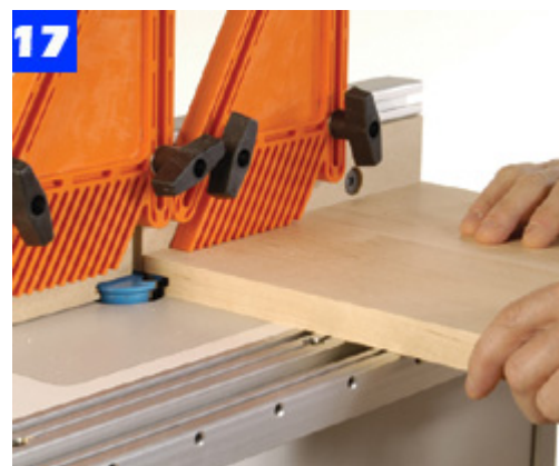
Use a drawer-lock-joint bit in the router table to shape joints on each end of the front drawer panels.

Burnish the dry surface with 4/0 steel wool and then buff with a soft cloth. Reattach the tabletop to the base and install the drawers.