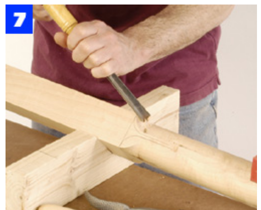
Use a gouge or rasps and files to shape the transition between the round and square sections of each leg.