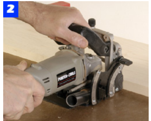
Clamp your work to the table, and cut the joining plate slots for assembling the wide top, side and back panels.

When the glue has completely set, remove the clamps and crosscut the panels to length (Photo 4).