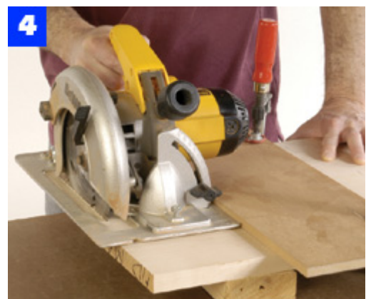
Clamp a straight board squarely across each panel and use it as a guide for crosscutting with your circular saw.