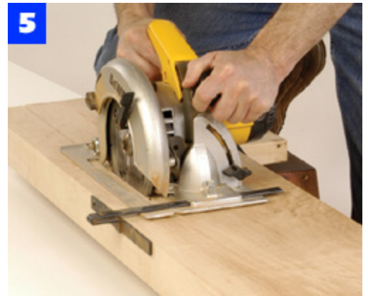
Use a ripping guide to help saw the leg stock. Cut half the depth from each face to avoid overloading the saw.

Mark the tenon shoulders on each piece, and use a dovetail saw or backsaw to make these cuts.